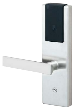
Satin Stainless Steel Finish (ST) Key Override available as an option.