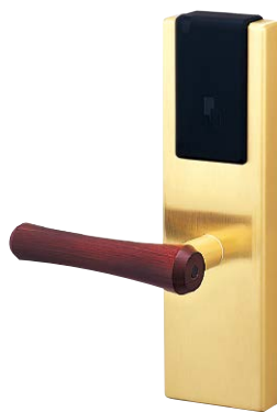
Satin Brass Finish (BS)