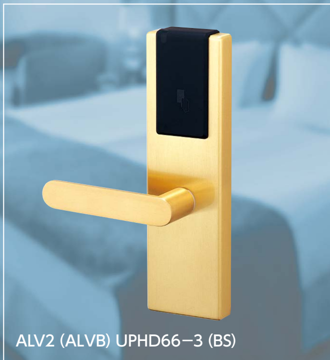
ALV2 (ALVB) UPHD66-3 (BS)

The pressed stainless steel escutcheon is available as standard in 5 high-quality finishes.