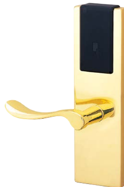
Polished Brass Finish (YB)