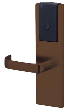
Mid Bronze Finish (CB)