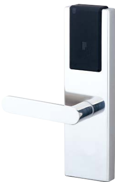
Polished Stainless Steel Finish (SB)