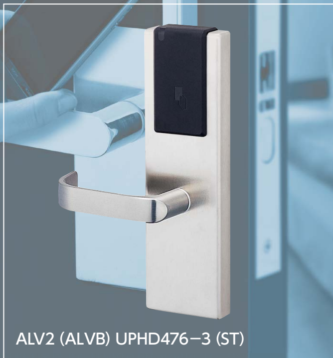
ALV2 (ALVB) UPHD476-3 (ST)